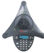
SoundStation® IP 4000

The quality of Polycom designed for offices and small meeting spaces, with Bluetooth available.